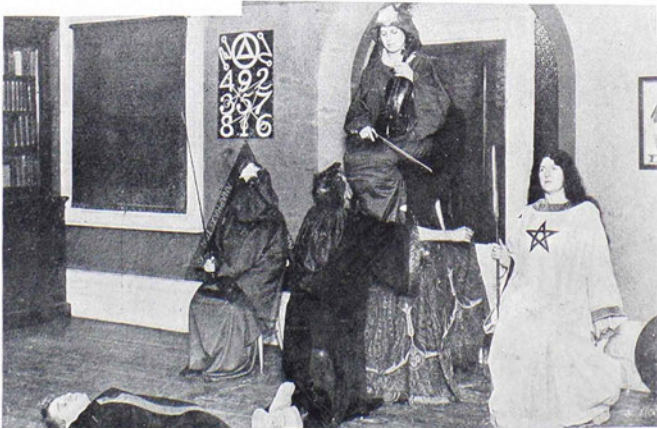
A Scene from the Rite of Luna

Sufficient has been said to indicate that nine o'clock ecstasies will be an unusual and exciting experience. To obtain admission, one must communicate with the "Guardian of the Flame" himself, in the flesh, Mr. Aleister Crowley, the poet (compared with Coleridge, Shelley, Keats, etc.), and Editor of "The Equinox," 142, Victoria Street.