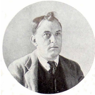
Mr. Aleister Crowley Editor of The Equinox , who devised the ceremonies

The first of a series of seven rites, each dedicated to one of the planets, is to be held at the Caxton Hall, Westminster, on Wednesday, the 19th (Saturn night), at nine sharp.