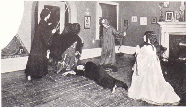
The Rite of Saturn Suicide of the Atheist

The first of a series of seven rites, each dedicated to one of the planets, is to be held at the Caxton Hall, Westminster, on Wednesday, the 19th (Saturn night), at nine sharp.