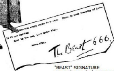
"BEAST" SIGNATURE Fantastic Conclusion to One of Crowley's Letters. He Always Signs Himself Thus.

Crowley, as I was saying, believed he was a sort of god, and seriously claimed that he could perform miracles. I don't believe in miracles, but he did have supernormal powers.