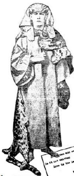
"LOVE CULT HEAD."

But in this chapter I want to tell of Aleister Crowley.