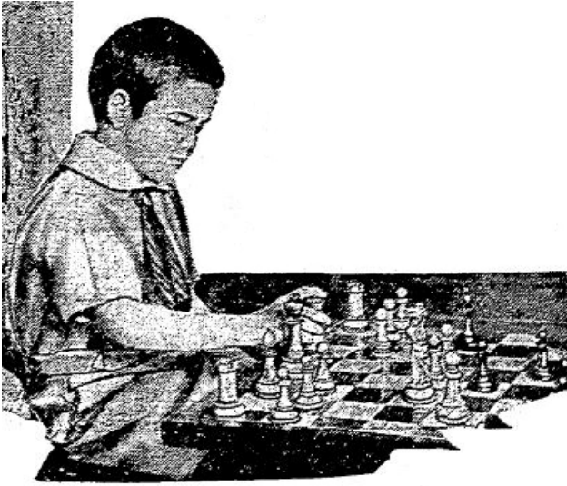
"BEAST NO. 2."