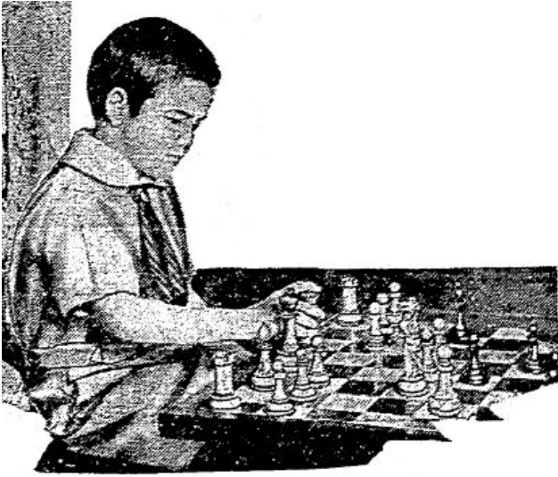
"BEAST NO. 2."