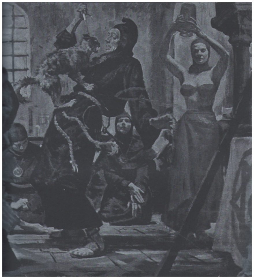
The sacrificial cat went wild and proceeded to climb the magician's frame, while the group continued its chanting.

he admitted to a list of ordinary schoolboy sins. He was told that he was lying and the floggings began.