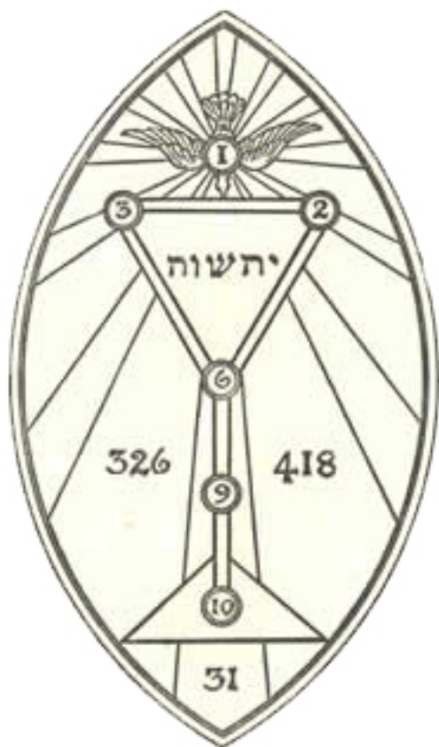
The Qabalistic Chalice of Ecstasy