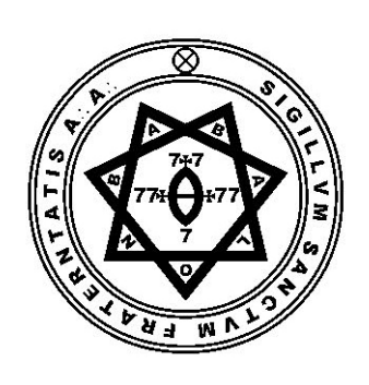
A∴A∴ Publication in Class B